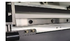
High quality imported THK high precision guide rail