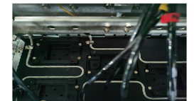
Heating of the bottom plate of the nozzle