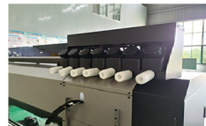
1.5L bulky ink bottle with lack of ink alarm system represents the advanced concept of industrial application