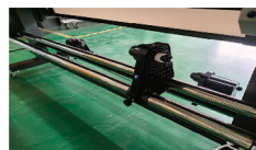
External power supply, intelligent rolling system.